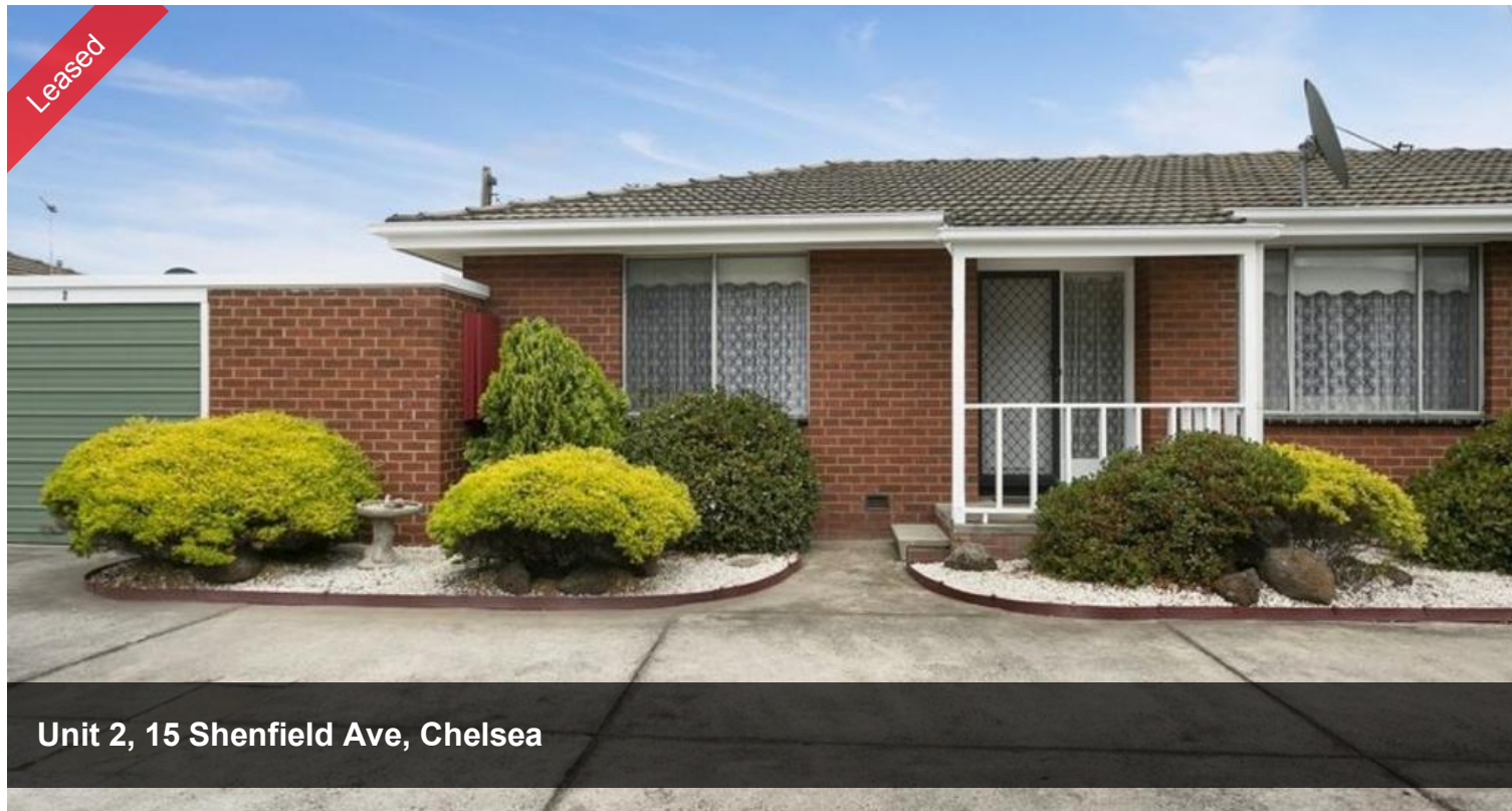
Unit 2, 15 Shenfield Ave, Chelsea