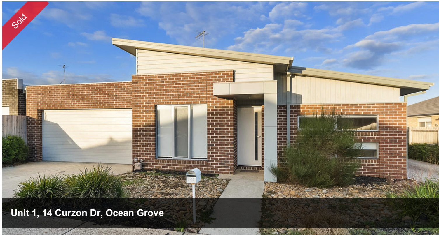
Unit 1, 14 Curzon Dr, Ocean Grove